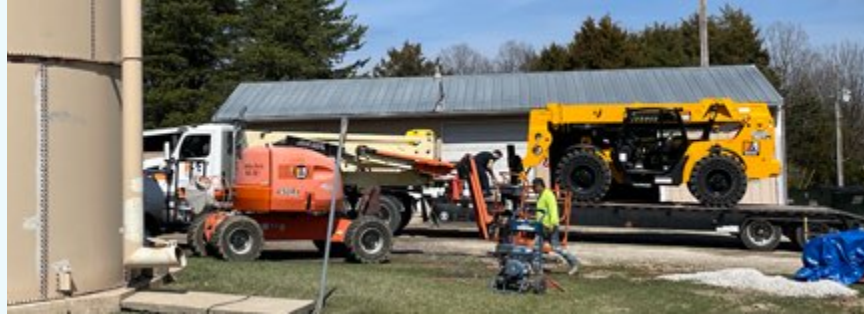
Peaceful Valley Lake community water tank at left with workers and equipment for refurbishment project Mar. 24