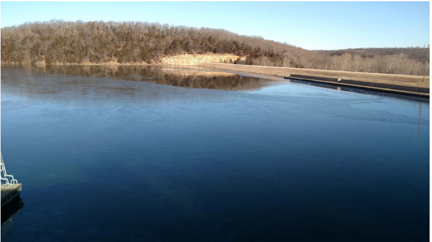
Ice forming on the lake on Groundhog Day 2018--Punxsutawney Phil saw his shadow in Pennsylvania and would have seen it here, so it looks like we have 6 more weeks of winter!