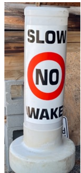
FYI, "No Wake" means 5 mph or less